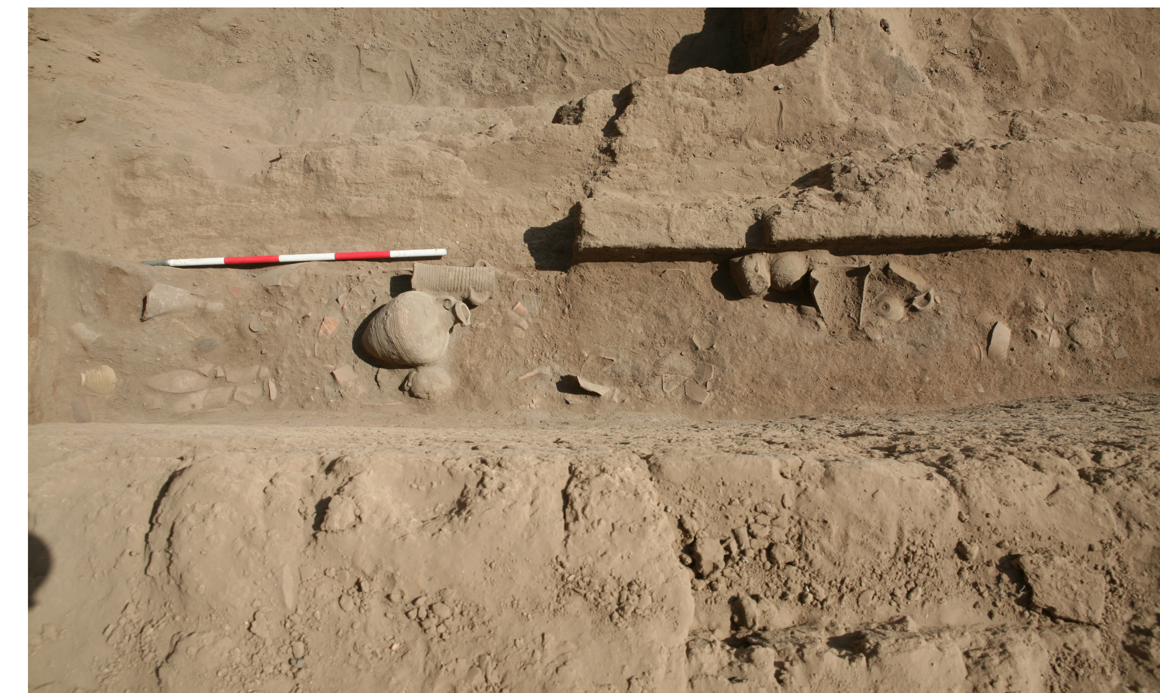
Fig. 2: Waste layer between two houses in area 2

In the course of excavations in the ancient urban area (fig. 1) of Syene, modern Aswan, in 2012 revealed a finding between two houses that could be interpreted as a waste disposal from the 1st century to the early 3rd century CE (fig. 2). The majority of the material disposed of is pottery, the evaluation of which is the focus of this project (fig. 3). The waste layer from Syene represents a unique finding for Upper Egypt, which consistently allows references to be made to the present day. Waste management is not only an important, ubiquitous topic, but is also increasingly finding its way into archaeology as a discipline in its own right ("archaeology of waste"). Due to the interdisciplinary evaluation of the finds (pottery, glass finds, animal bones and botanical remains), the project can also be considered a pioneer project for the region and leads to a significant expansion of the research horizon. The temporal limitation of this find complex also allows detailed studies, which in turn will bring new insights in ceramological terms.